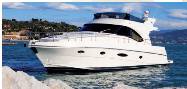
Cayman 55 HT Project